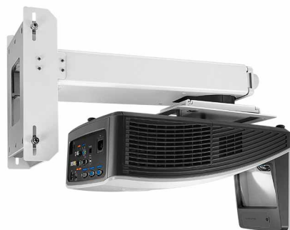
PointWrite Kit (PW01U)