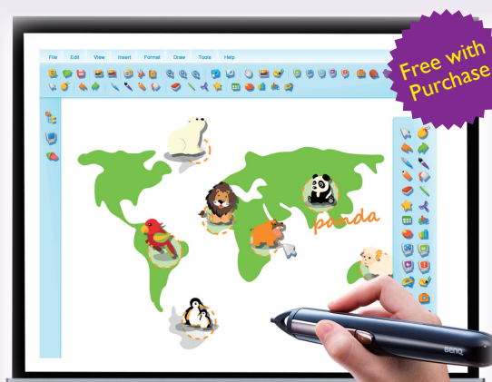
A+ Software for Teachers

Q Draw consists of two sets of customizable tools. The standard tool set includes everyday features such as save, zoom, undo, redo and so on. It also includes a media clip function that allows teachers to record every teaching step. The advanced tool set helps teachers draw lines and shapes, screen what their students see in class and even provide spotlight effects to enhance learning!