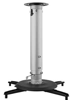
Ceiling Mount P/N: 5JJAM10.001

*Lamp life results will vary depending on environmental conditions and usage. Actual product's features and specifications are subject to change without notice.