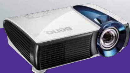
LX60ST / LW61ST

The new LX60ST and LW61ST are the first in the world to incorporate blue core, a next generation light engine which utilizes the unparalleled qualities of a laser light source to achieve optimized energy efficiency, projection performance and readiness. The blue core-enhanced SmartEco™ Advanced technology further reduces light source power consumption by up to 90% for a significantly lowered total cost of projector maintenance and ownership. Lamp free, the BenQ LX60ST and LW61ST also make a safer and more environmentally friendly choice for your school.