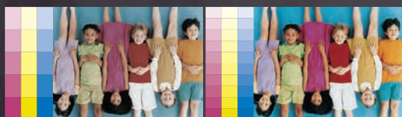
Conventional 8-bit processing BenQ 10-bit processing

Driven by HQV Technology, standard definition video is transformed! Content is de-interlaced, noise is reduced and images are elevated to HD quality through resizing and scaling up to 6 times. Independent pixel processing, true 10-bit color and independent color management deliver astounding image precision, color and clarity.